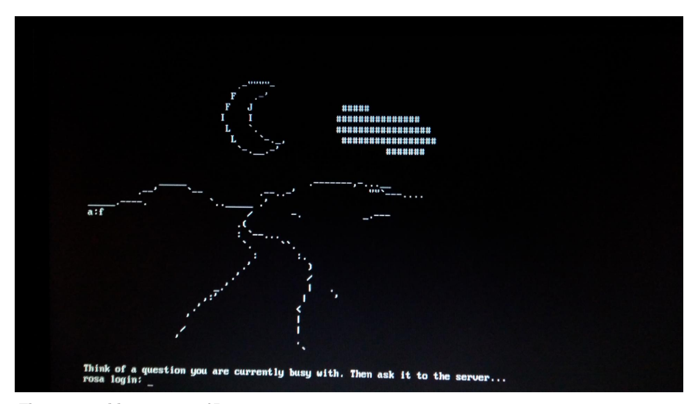
The command-line prompt of Rosa.