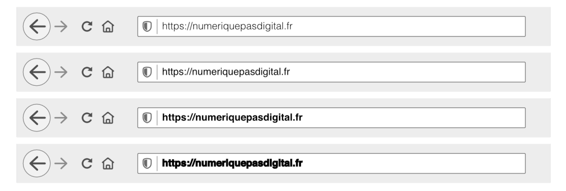
Cahier d'idées pour un navigateur écologique, Praticable, consommer des données de saison, 2008