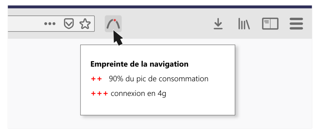
Cahier d'idées pour un navigateur écologique, Praticable, consommer des données de saison, 2008