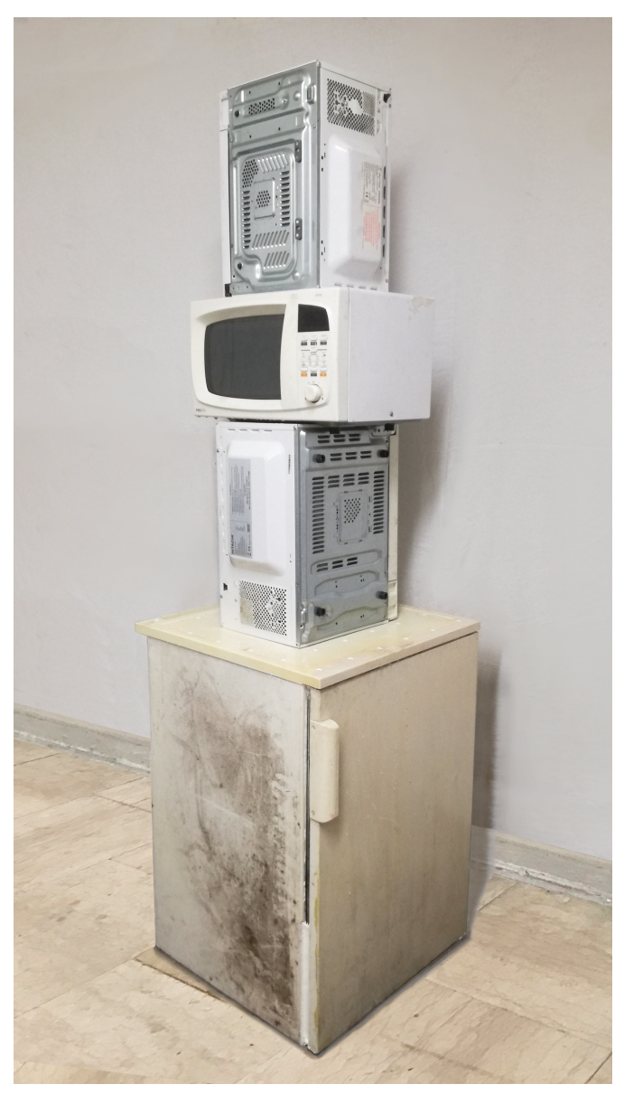
Fountain, Fridge, micro-wave, pump, silicon, water, 2018. A fridge turned into a tank distributes water to a column of three piled up microwaves. High class status than that of "fountain" for these salvaged devices.