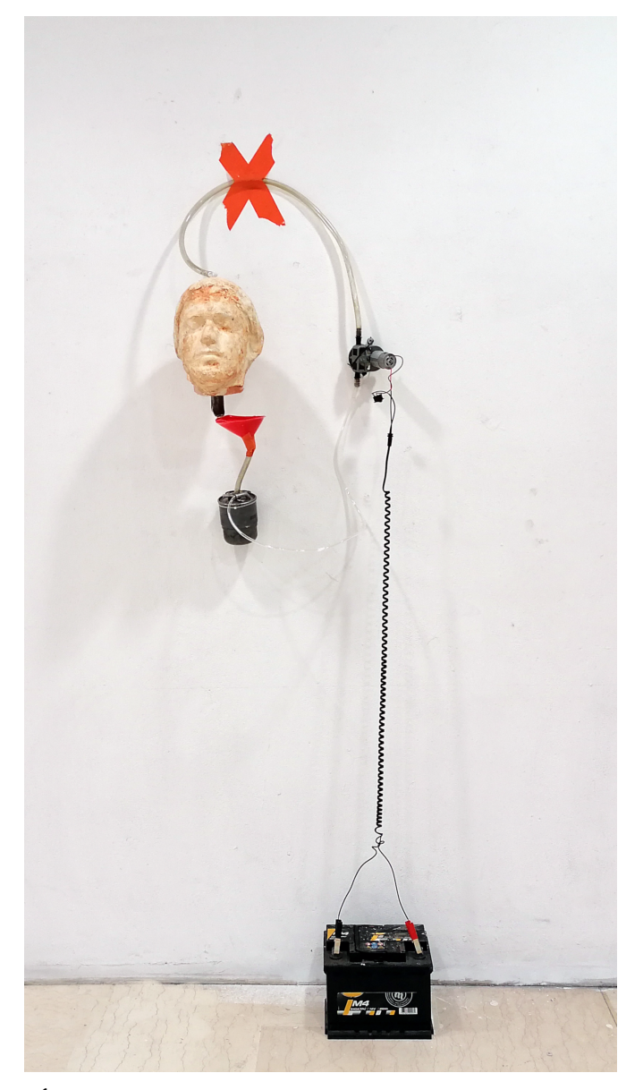
Éloge à l'éloge du carburateur , Cart, parts of electric scooter, metal, plastic, 2020. A plaster moulded head is gradually eaten away by waste oil.