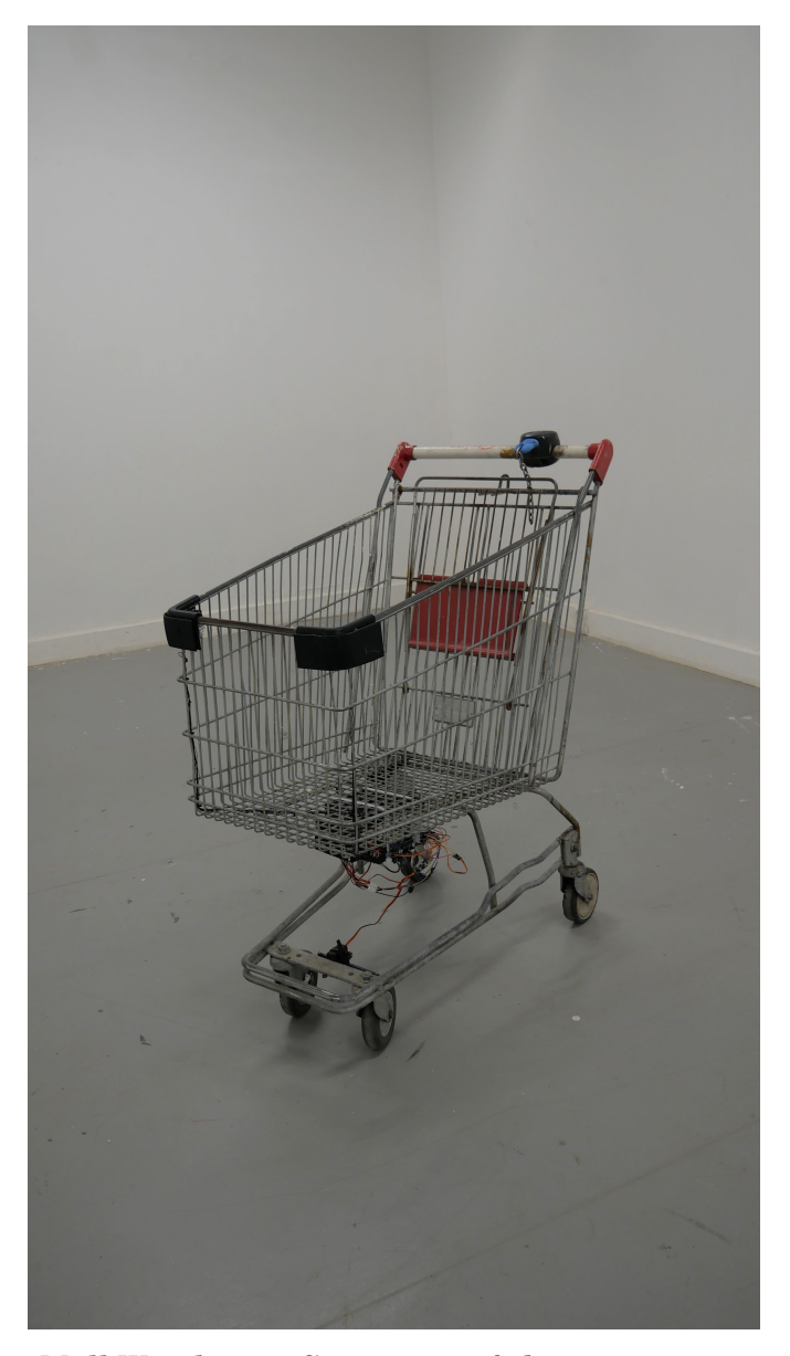
Mall Wandering , Cart, parts of electric scooter, metal, plastic, 2021. A cart wanders alone and restlessly in a closed space. Whenever it trips over an obstacle, it rolls back and takes another direction.