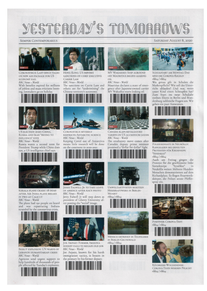
The Screenless Office, Brendan Howell, A Printed custom newspaper, 2020